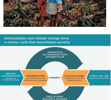
Rainforests are destroyed for a variety of reasons, including logging, cattle ranching and commercial agriculture. Rainforests once covered around 12% of Earth's land surface. As a result of deforestation rainforest cover has reduced to about 5%.